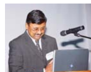
Bala announcing the Election results