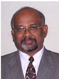
Itticheria Newsletter Editor